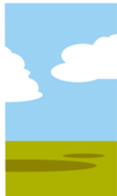
How the project was documented