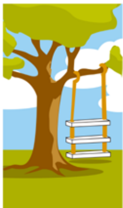
How the customer explained it