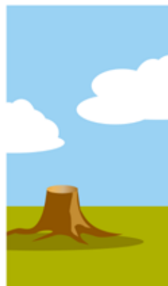
How it was supported