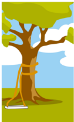
How the Programmer wrote it