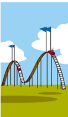
How the customer was billed