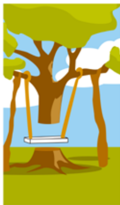
How the Analyst designed it