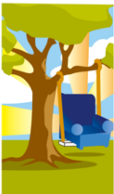
How the Business Consultant described it