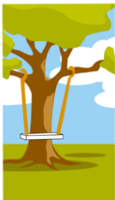
How the Project Leader understood it